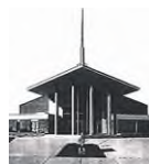
First Seventh-day Adventist Church of Tulsa