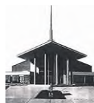
First Seventh-day Adventist Church of Tulsa