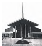
First Seventh-day Adventist Church of Tulsa